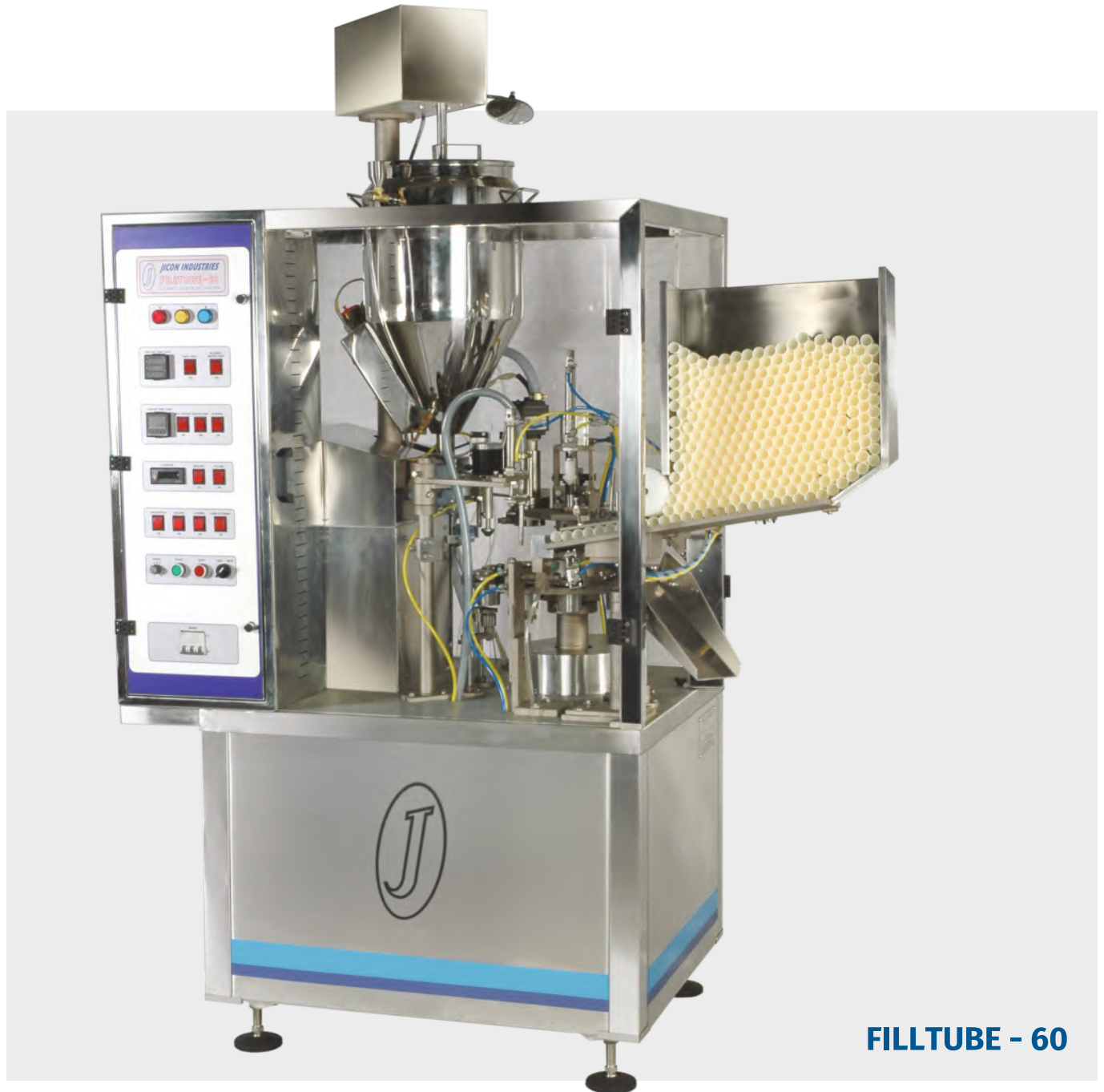
FILLTUBE - 60

viscous products by means of volumetric dosing system. These machines are designed and manufactured to suit GMP requirements, all contact parts are stainless steel, well polished and mirror buffed. These machines are produced from tested and reliable materials for long service life.