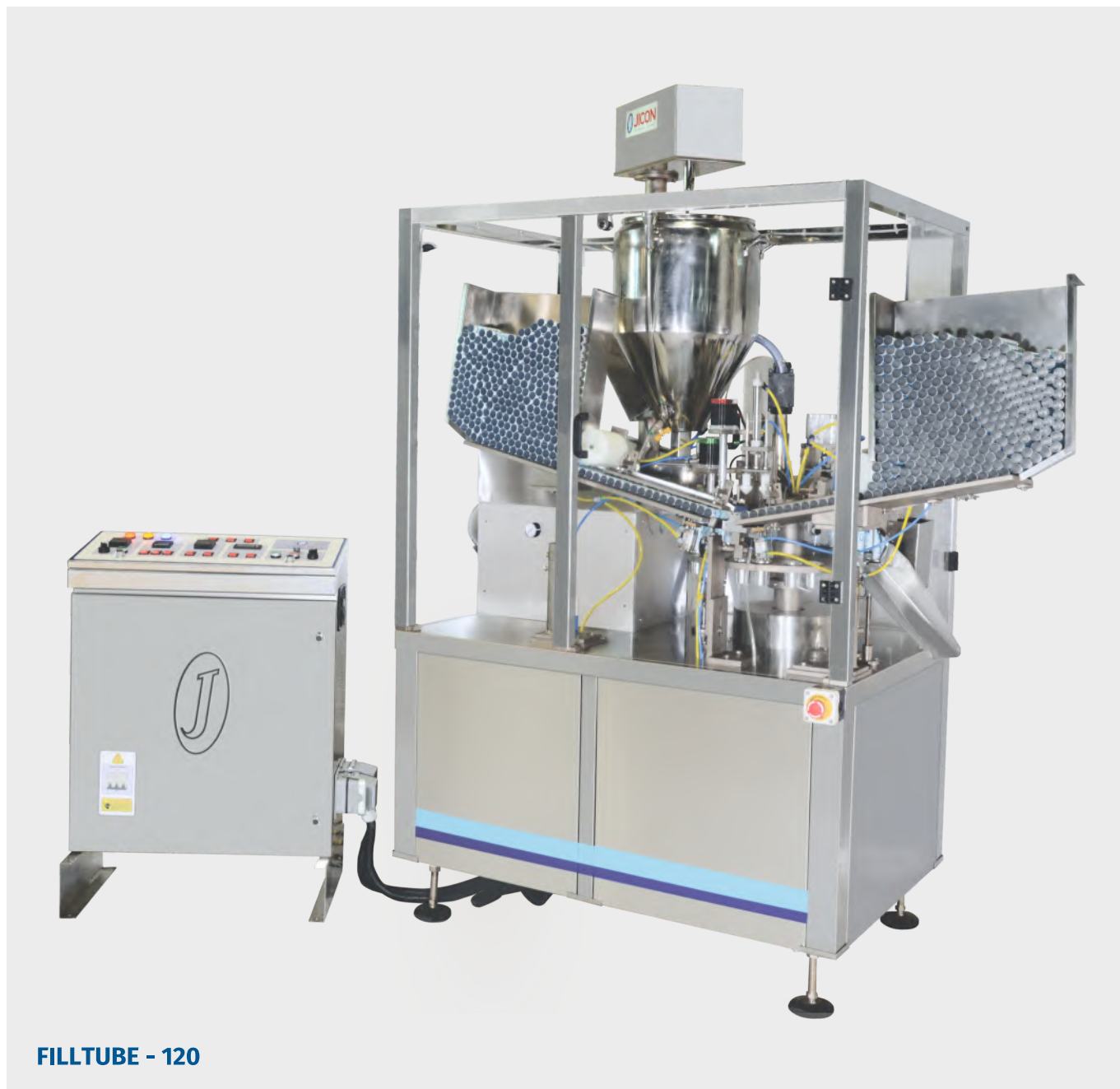
FILLTUBE - 120